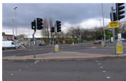
A65 Kirkstall Road

We decided on the basis of the evidence presented to us not to undertake further scrutiny of this matter.