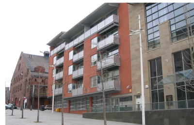
Off Millennium Square