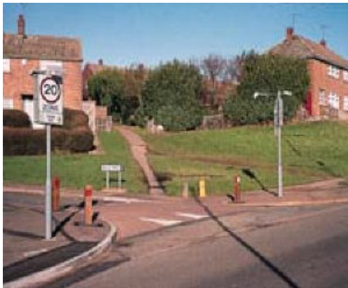
Typical entry to a 20mph Zone

We reviewed the rationale behind the strategy for introducing 20mph zones in certain parts of the city. We noted that Leeds requires that there must be put in place a significant number of speed reducing features such as speed humps so that speeds are reduced and kept down to 20mph throughout the zone, although this is not required elsewhere (notably Portsmouth). The department's resources in this regard are targeted towards areas where there have been accidents. We noted that frequent changes in speed limits can be unnecessarily confusing to drivers.