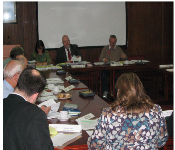
Scrutiny Board (City Development)