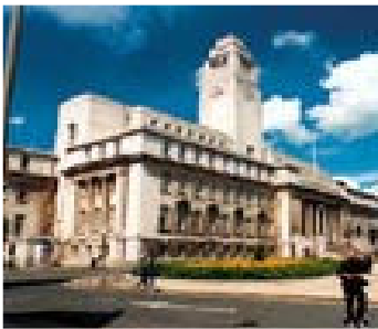
University of Leeds