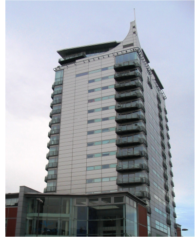
K2 City Centre

We received some anecdotal evidence of the reluctance of older people, seeking to down-size, to move into the city centre.