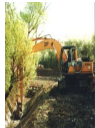
Land Drainage Works