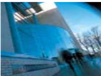
Leeds Metropolitan University