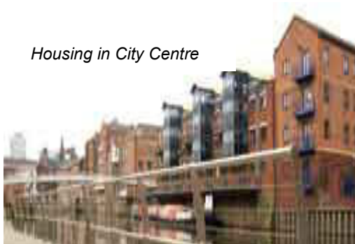
Housing in City Centre

We reviewed progress in delivering “Sharing the Success”, the Leeds Local Enterprise Growth Initiative. We were delighted to hear that 20 projects are up and running, including two flagship projects as a result of this initiative.